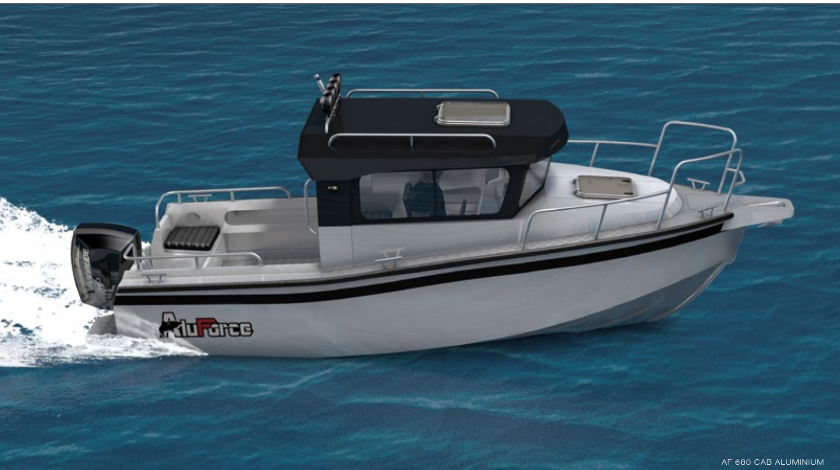
AF 680 CAB ALUMINIUM