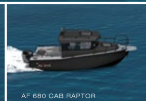
AF 680 CAB RAPTOR