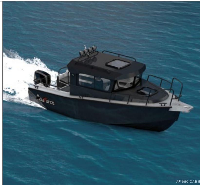
AF 680 CAB B