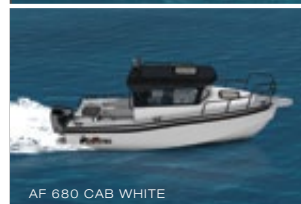
AF 680 CAB WHITE