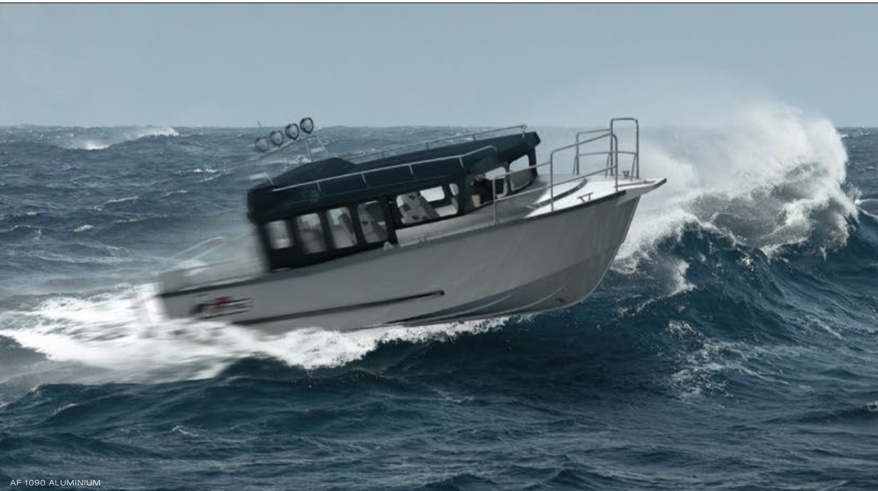
AF 1090 ALUMINIUM