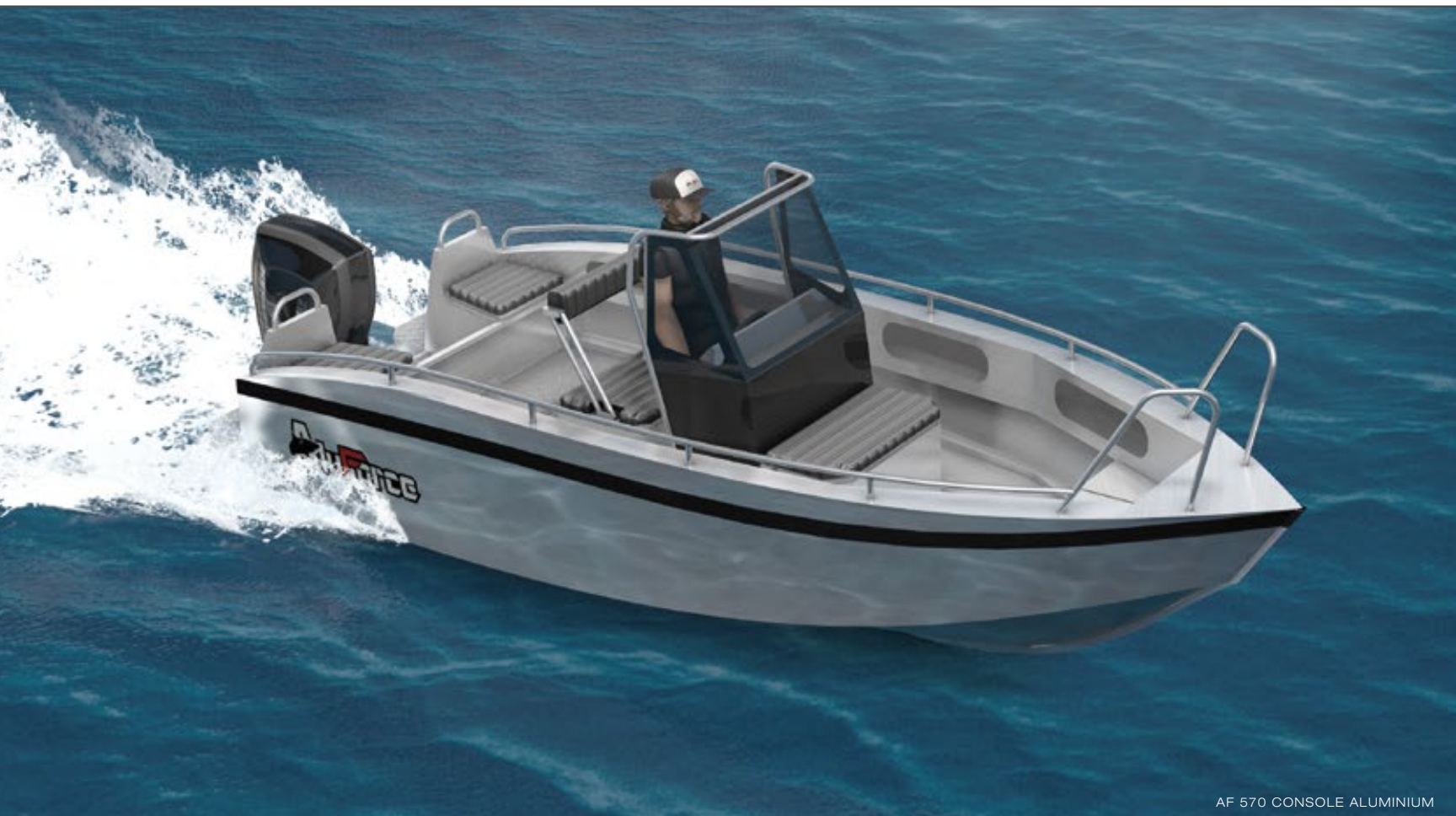
AF 570 CONSOLE ALUMINIUM