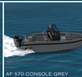
AF 570 CONSOLE GREY