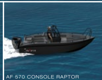
AF 570 CONSOLE RAPTOR