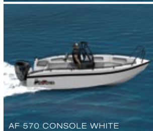
AF 570 CONSOLE WHITE