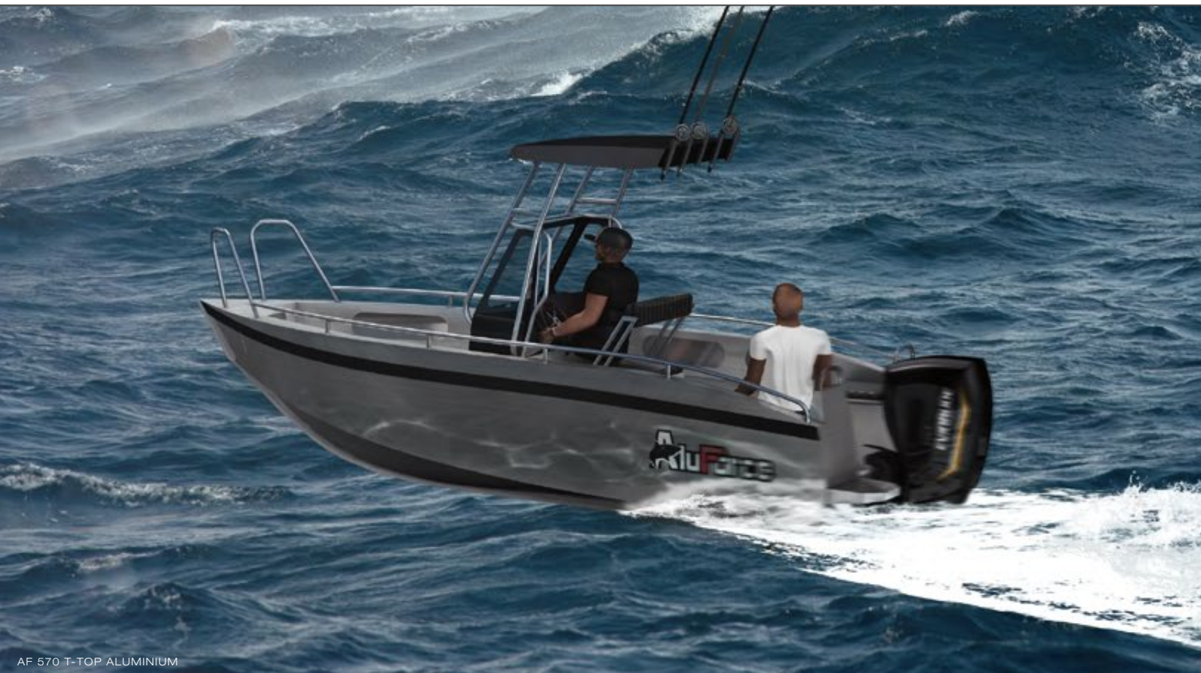
AF 570 T-TOP ALUMINIUM