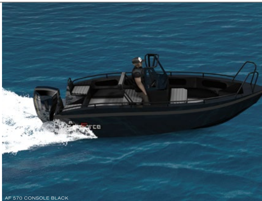
AF 570 CONSOLE BLACK